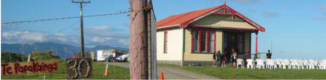
Ngā Hau E Whā o Paparāangi Papakainga is an Historical Trusts Building which had its 100th Birthday on Nov 2012