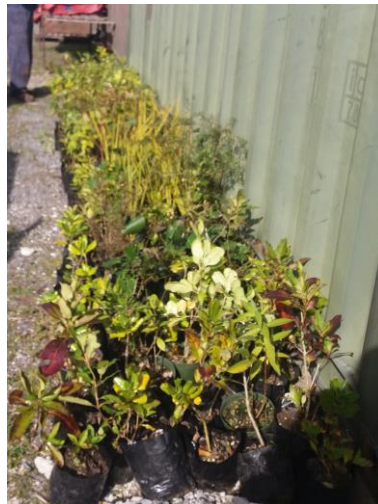
“Natives from WCC for planting”

Wednesday 2 – CVNZ volunteers, Whakatō rākau/Planting, 9am – 2pm