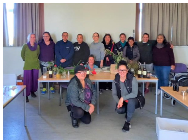
"NHEWOP Rongoa Workshop"

Kaua e wareware/don't forget, elections are now in Whiringa-ā-nuku/October, so enroll to vote and have your say! You will still be able to cast your vote here at NHEWOP, for more information go to: www.elections.nz