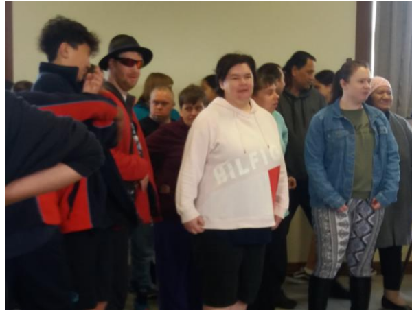
"Waiata time with IHC & NIS"

The Matariki Hāngī lunch for Mary Potter Hospice and IHC/IDEA services was a great success and enjoyed by all. Thank you to our Hāngī crew for a delicious meal!!!