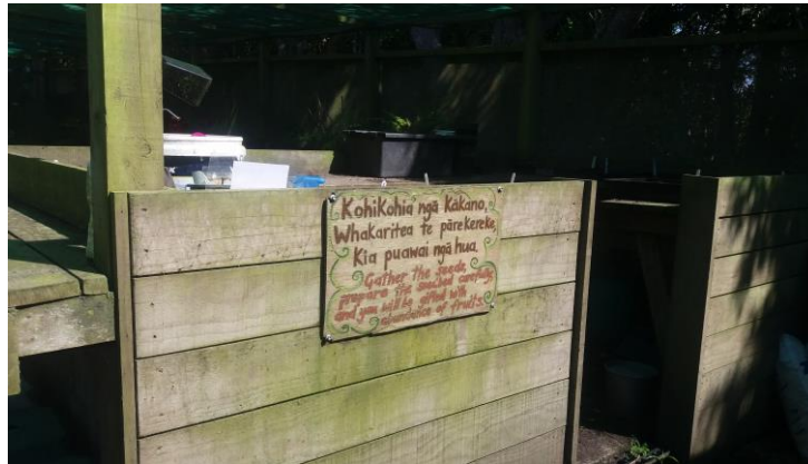
"Work station inside the whare pārekereke"

Ngā Hau e Whā o Paparāangi Whare pārekereke (Nursery on Jay Street) – Do you have an interest in planting and propagating native plants? Would you like to learn? We are looking for volunteers to help out at our Whare pārekereke (Nursery) situated next to the Northern Community Gardens on Jay Street, Newlands. We have a community space which caters to schools and community organisations and we have a mātauranga space which caters to NHEWOP's Planting project, educating kids about plants and specializes in Natives used in Māori arts such as Rāranga, Rongoā and Kai. For more information contact us on - kaitari@nhewop.org.nz