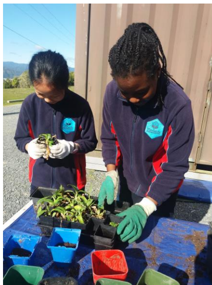
“NIS students repotting Rengarenga”

Saturday 26 – Private booking, 8am – 6pm