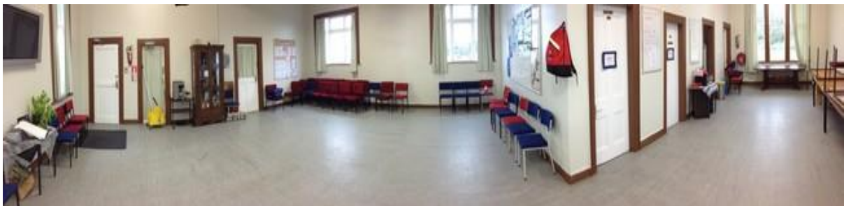
"A look inside our space"

Venue available – Do you have a great craft or activity that you would like to share with our community? Do you have a special event coming up? we have a great venue that may suit your needs, go to our website – www.nhewop.org.nz or you can contact us via email on – kaitari@nhewop.org.nz