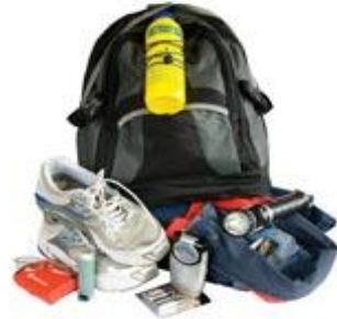
"Your personal Grab & Go bag"

Newlands and the marae are ready in an emergency! If you are interested in helping us be more prepared or would like to learn more contact us - kaitari@nhewop.org.nz