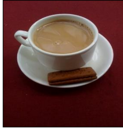
“Drop in for a cuppa”

Tuesdays & Thursdays – Open drop-in days – 10am to 2pm