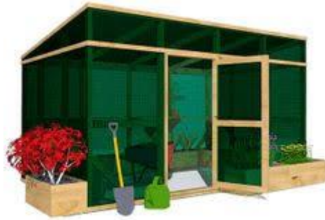
“Building our mini whareparekereke”

Friday 7/Saturday 8 – Construction of Maara wharepārekereke/ Garden nursery, 9am – 4pm