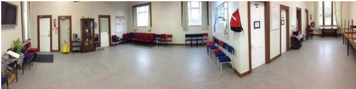
“A look inside our space”

Venue available – Do you have a great craft or activity that you would like to share with our community? Do you have a special event coming up? we have a great venue that may suit your needs, go to our website – www.nhewop.org.nz or you can contact us via email on – kaitari@nhewop.org.nz