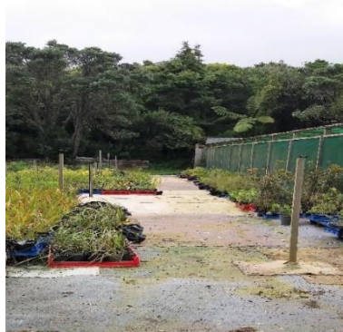
“Outside the Whare pārekereke/Native Nursery”

Ngā Hau e Whā o Paparāangi Whare pārekereke (Nursery on Jay Street) – Do you have an interest in planting and propagating native plants? Would you like to learn? We are looking for volunteers to help out at our Whare pārekereke (Nursery) situated next to the Northern Community Gardens on Jay Street, Newlands. We have a community space which caters to schools and community organisations and we have a mātauranga space which caters to NHEWOP’s Planting project, educating kids about plants and specializes in Natives used in Māori arts such as Rāranga, Rongoā and Kai. For more information contact us on - kaitari@nhewop.org.nz