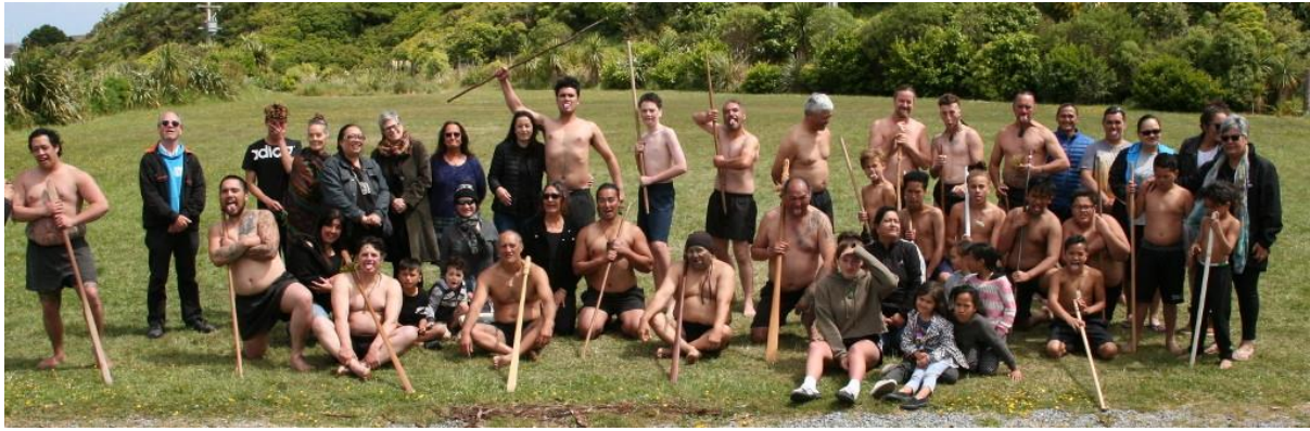
"Taiaha Ropu @ Neighbours Day"

30 LADBROOKE DRIVE, NEWLANDS, PO BOX 26-049, NEWLANDS 6442 • WWW.NHEWOP.ORG.NZ