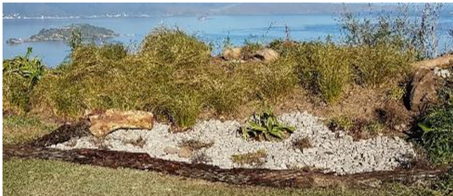
"New Mokomoko habitat"

Friday 13/ Sunday 15 - NHEWOP Property Maintenance, 8am – 6pm