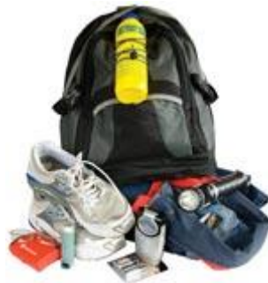
“Your personal Grab & Go bag”

Remember – You need to make sure your whanau is ready in an emergency by being prepared!