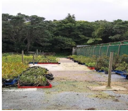
“Outside the Whareparekereke/Native Nursery”

30 LADBROOKE DRIVE, NEWLANDS, PO BOX 26-049, NEWLANDS 6442 • WWW.NHEWOP.ORG.NZ