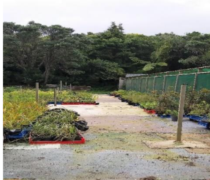
"Outside the Whareparekereke/Native Nursery"

schools and community organisations and we have a matauranga space which caters to NHEWOP's Planting project, educating groups about plants and specializes in Natives used in Maori arts such as Raranga, Rongoa and Kai. For more information contact us on - kaitari@nhewop.org.nz