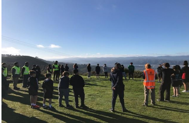
The schools & volunteers involved in our Matariki Planting!

Wednesday 10 – NHEWOP Committee Hui, bring a plate to share, 6.30pm – 8.30pm