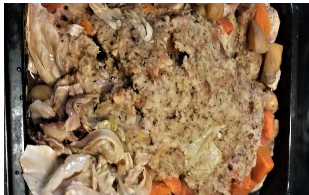
“Maara tunu – Hangi in the oven!”

Sunday 28 – NHEWOP Maara Tunu wānanga, learn how to make Fried bread and fritters! Register by reply email as spaces are limited!!!