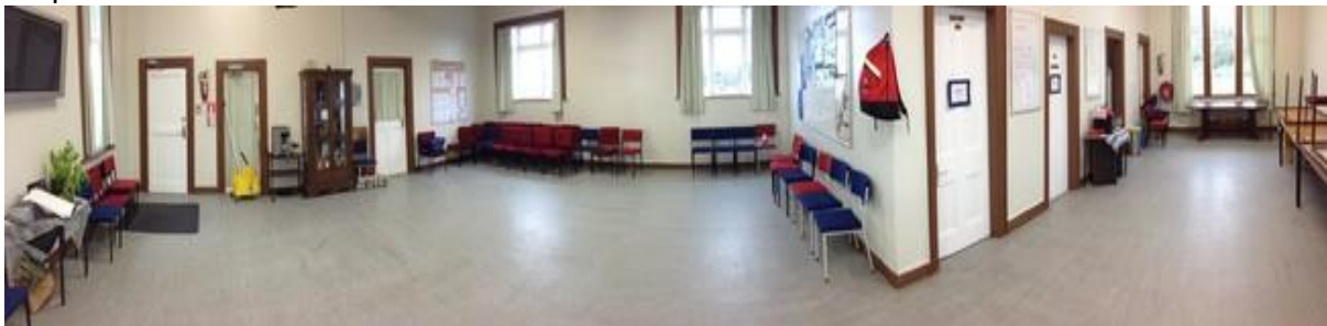
“A look inside our space”

Venue available – Do you have a great craft or activity that you would like to share with our community? Do you need a meeting space or have a special event coming up? we have a great venue that may suit your needs, go to our website – www.nhewop.org.nz or you can contact us via email on – kaitari@nhewop.org.nz or cell phone – 0226109821 for all enquiries.